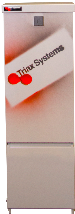
Spray paint on an outdoor enclosure with an anti-graffiti surface treatment

Triax Systems A/S accepts no responsibility for the anti-graffiti surface treatment, if the given instructions are not followed.